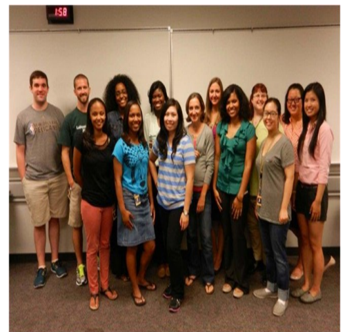
LSUSOM PREMATRICULATION 2014